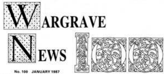
Issues 1 (above) and 100 (right)