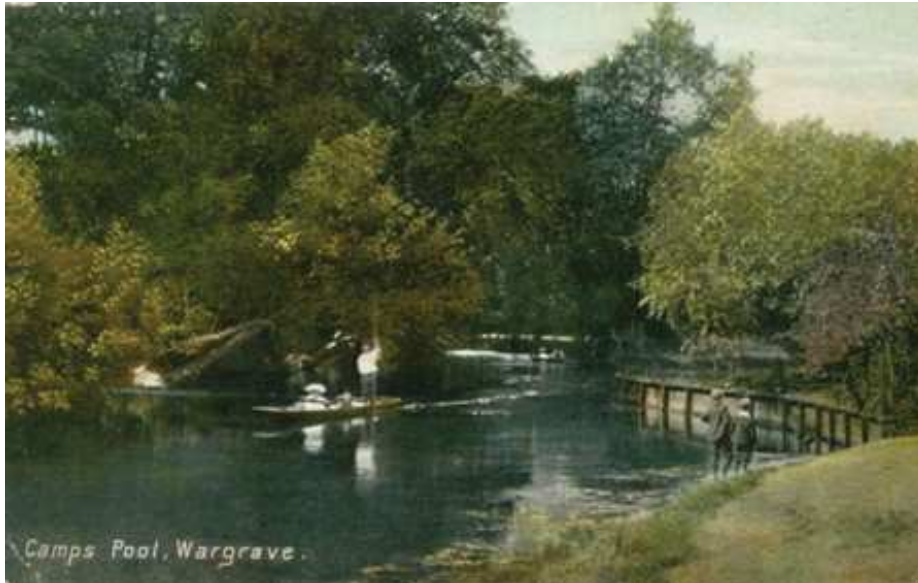
This atmospheric scene of Camps Pool was published by William Sansom, oat the Post Office in the High Street

Sequences of others show how an area of the village, such as the church or the High Street, have changed over the century. Some were even published by local Wargrave businesses, and many bore a Wargrave postmark, or were addressed to homes in the parish.