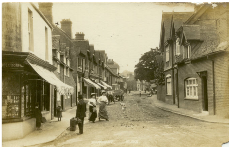
This is an early 1900s scene in the High Street

For the rest of the evening, members were able to see presentation showing a selection from the 'Bird Collection' of postcards recording the village over the past hundred years or so. The collection had been added to the Society archives during the past year, and will provide a useful resource for future research.